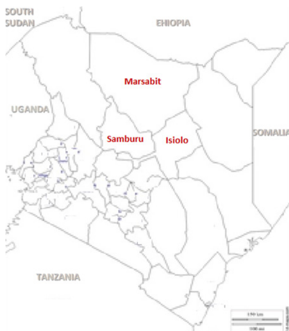
Figure 1. Study sites for the scoping Missions

Two scoping missions were undertaken between April and June 2016. The first mission had a wider scope and targeted a range of stakeholders to gain insights on existing systems, their outcomes and implications, and the feasibility of improvements. Data was collected mainly through key informant interviews (KIIs) and focus group discussions (FGDs). A total of 16 KIIs were conducted with government officials, local non governmental organizations (NGOs), veterinary service providers, commercial insurance agents, traders, brokers, livestock keepers, mobile phone sellers and fodder-production group leaders. Four FGDs were conducted with groups of pastoralists in Kinna and Oldonyiro locations. The respondents were asked to give details about their information needs, channels through which they receive information, existing information dissemination structures, the type and use of mobile phones owned and their thoughts about the use of information and communication technologies (ICT) in collecting and disseminating information. The insights generated from the first mission provided further evidence in support of investing in a crowdsourced-based digital platform as the basis of a sustainable MIS. The information collected was used to develop a paper version of the functionality of the envisioned crowdsourcing platform, in the form of a